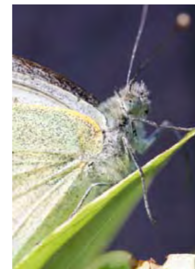
The level of detail that the Tamron can capture is incredible, but focusing is critical to ensure the maximum possible sharpness.