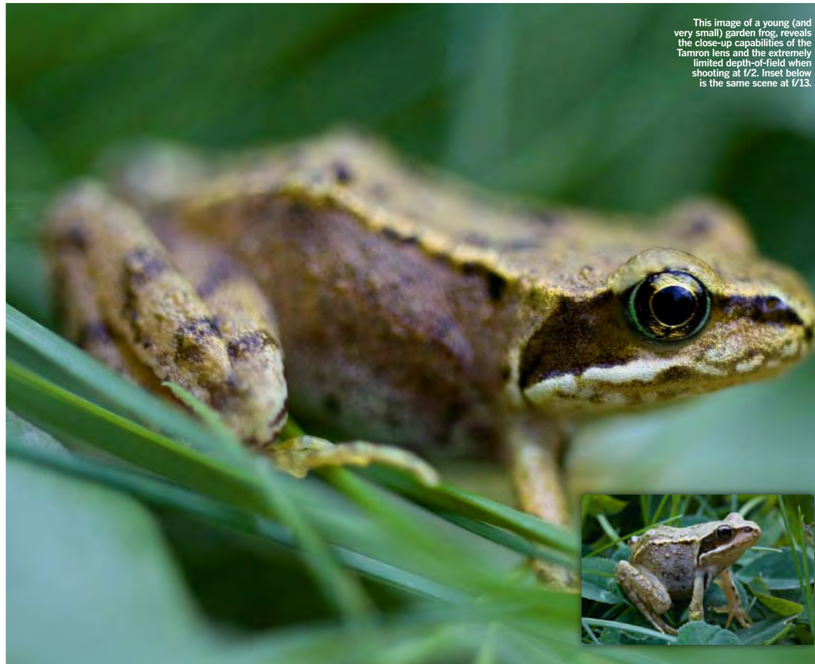
This image of a young (and very small) garden frog, reveals the close-up capabilities of the Tamron lens and the extremely limited depth-of-field when shooting at f/2. Inset below is the same scene at f/13.

Image quality is excellent, with very high sharpness and good contrast throughout the image frame. In fact, the lens resolution is arguably higher than many image sensors can reveal, so producing sharp images shouldn't be an issue so long as you focus correctly. One area to take care with is with your choice of aperture, as selecting the maximum aperture produces an unbelievably shallow depth-of-field. There is little doubt that selecting f/2 will allow for very creative results, but ensure you check images on your LCD monitor, as with close-ups the limited depth-of-field is extreme to say the least! Daniel Lezano