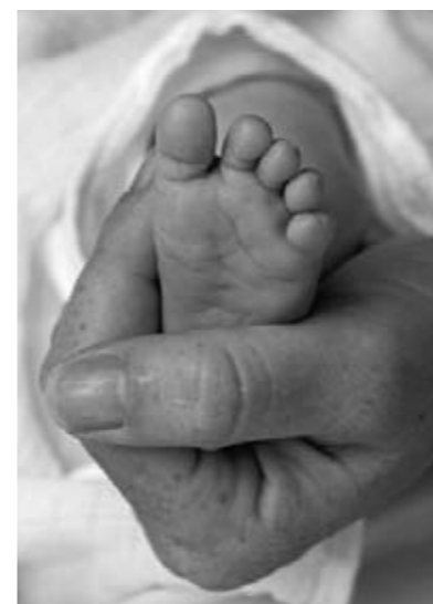
The short minimum focus allows you to get close for frame-filling shots of subjects where your standard zoom may struggle.

TAMRON SP AF 90MM F/2.8 DI MACRO £460 The latest version of Tamron's classic macro lens has been optically refined for digital and film users. It has a minimum focus of 29cm and acts as a useful medium telephoto when used on DSLRs with APS-C sensors. Available in Canon, Nikon, Pentax and Sony fittings.